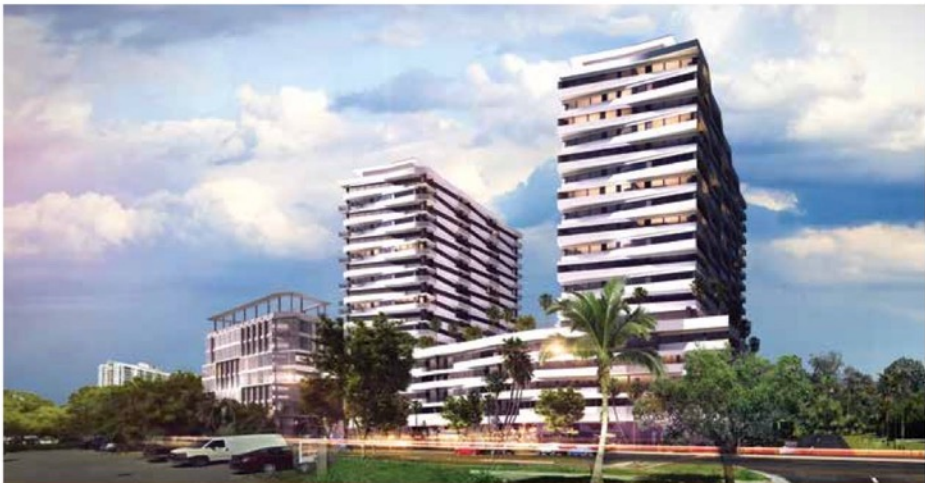
► Developer Macken Companies was approved to plan 5 Park , a mixed-used project in North Miami Beach.