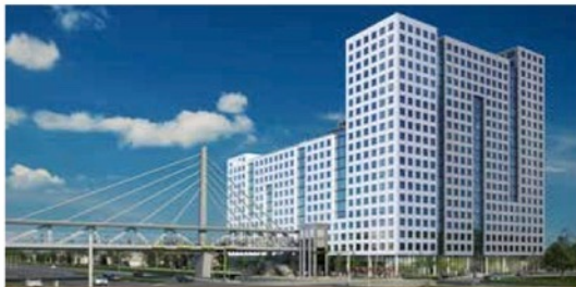
► University Bridge Residences will be developed across the street from Florida International University's main campus.

► Terra, New Valley, Great Eagle Holdings and Bizzi & Partners secured a $155 million loan for constructing Miami Beach's Eighty Seven Park , a 66-unit tower.